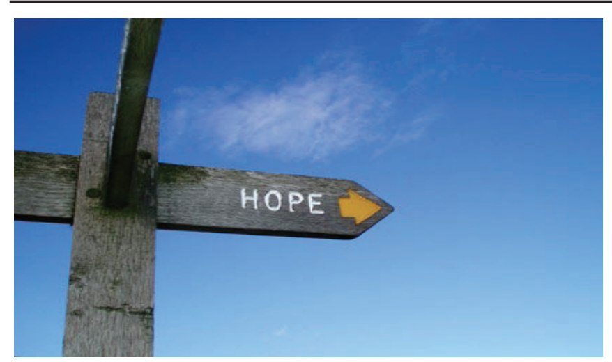
Luke 20: 27-38: The Question about the Resurrection

Happy Remembrance Day. Let us make the most of today by counting our blessings and standing proud. Lest We Forget.